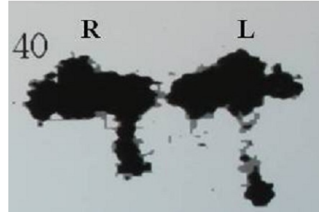
Fig 2. ^{99m}\text{Tc} tracer material in the lacrimal sac and nasolacrimal duct on the right side in the frame 40 (8 minutes and 56 seconds) indicating obstruction of nasolacrimal duct. However, the tracer material is seen draining into the nose on the left side indicating patency of nasolacrimal duct.

The images of obstruction of NLD on one side and patency of NLD on the other side are shown in Figure 2.