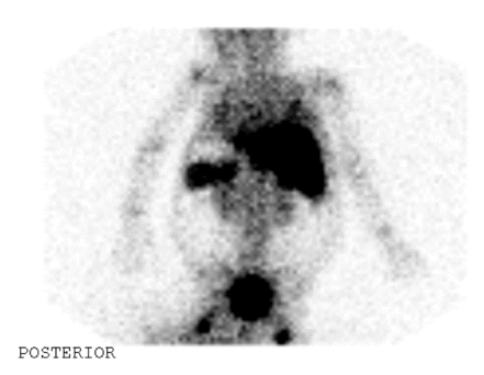
Fig 2. Anterior/Posterior spot images of the patient. Mild increased activity is also apparent on the spot view images (arrow). Tc-99m Phytate uptake is visible in the bone marrow and growth plates.