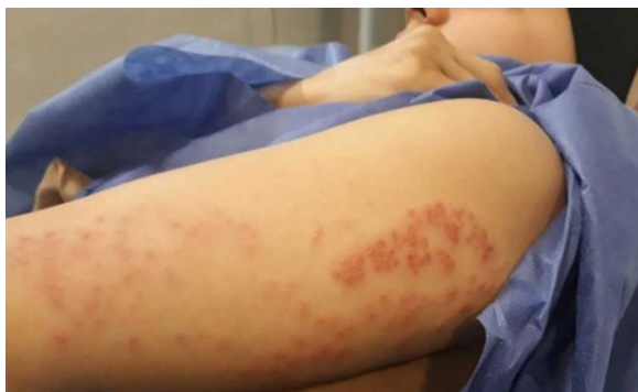
Fig 1. Varicella-zoster reactivation affected the left cervical nerve branches in the present immunocompromised case.

Potential diagnostic errors due to active herpes infection and its associated adenopathy have been reported [1-3]. Herein we report a case of herpes zoster and underlining the possibility of an active viral infection in an immunocompromised patient which may mimic recurrent disease. The importance of awareness of opportunistic infections and precise attention to the patient history and clinical assessment is emphasized (Figure 1).