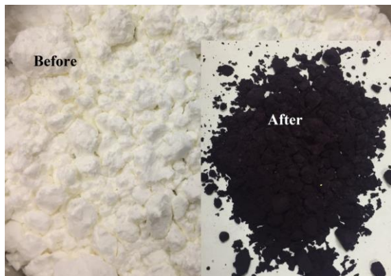
Fig 3. The starch powder before and after the stable iodine (I-127) trapping.

Fume hood was used for this study because Iodine has a volatilization nature. The first part demonstrates that the elemental Iodine trapped permanently by starch powder as showed by the deep blue color in Figure 3. This process will guarantee that the evaporated Iodine will not escape from the collected starch matrix. The starch has affinity of trapping Iodine permanently, while the sugar as an example do not have this property. The sugar was selected for comparison as it was available option and easy to show.