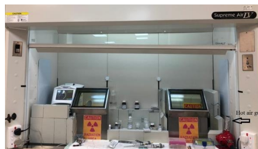
Fig 1. The experimental setup inside fume hood.

changes. Figure 2 shows the stable Iodine I-127 and the volatile Iodine fumes after heating.