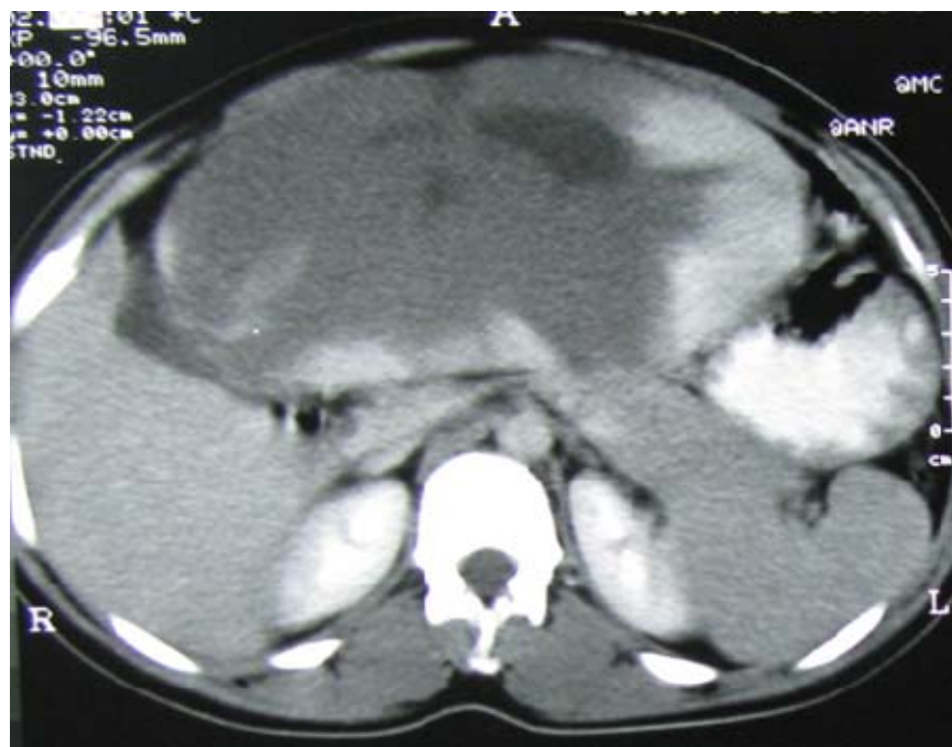
Figure 1. Large hepatic mass in the transverse images of abdominal CT-scan. Note photopenic areas inside the lesion possibly related to scarring.

Abdominal CT-scan images revealed a large hypo dense mass sized 19*15*11cm in the left liver lobe, extending to the right and lower abdominal regions (Figure 1).