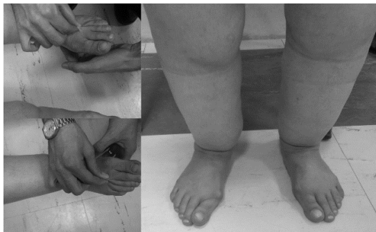
Fig 1. Picture of the lower limbs of the patients (right side). The left side shows bilateral negative Stemmer's sign.

A 35 year-old woman presented with symmetrical swelling of the lower limbs since 5 years ago with sparing of the feet was referred to our department for lower limb lymphoscintigraphy (Figure 1: right side image). The patient laboratory exams (including BUN, creatinine, and liver function tests) were all normal. Lower limb Doppler ultrasound showed normal blood flow in the arteries and veins of the lower limbs. On physical examination, there was non-pitting edema of the lower limbs and Stemmer's sign was negative bilaterally (Figure 1: left side images). The patient had no family history of leg swelling and reported no underlying disease or taking any medication. The referring physician was suspicious of lipoedema and ordered lower limb lymphoscintigraphy to rule out lymphedema.