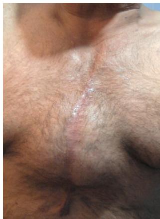
Fig 1. Postoperative photograph at 2 years.

A 52-year-old man who underwent coronary artery bypass graft (CABG) developed high-grade fever and chills; his condition deteriorated gradually. Therefore, following sepsis workup, a course of antibiotic treatment was initiated. In physical examination, a pulsatile protrusion along the mid-sternal line was detected. Diagnosis was sternal nonunion followed by an incisional hernia (Figure 1).