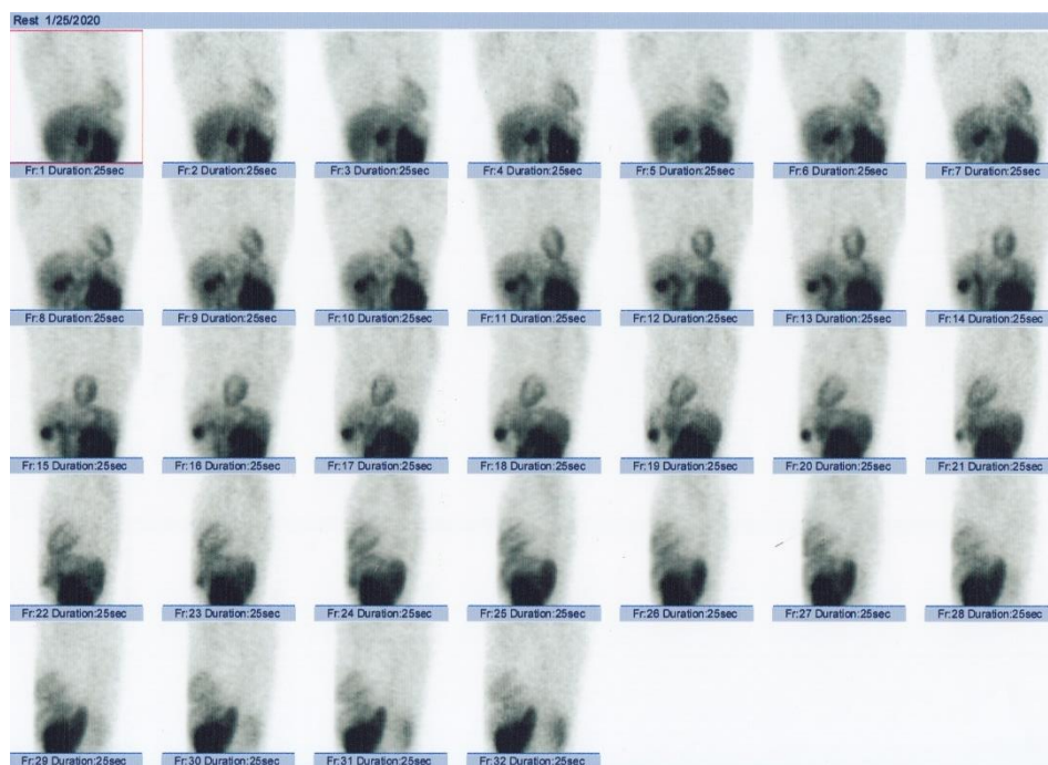
Fig 2. Rotating planar projection images reveal truncation of the apex between frames of 24 to 31 during the rest acquisition.