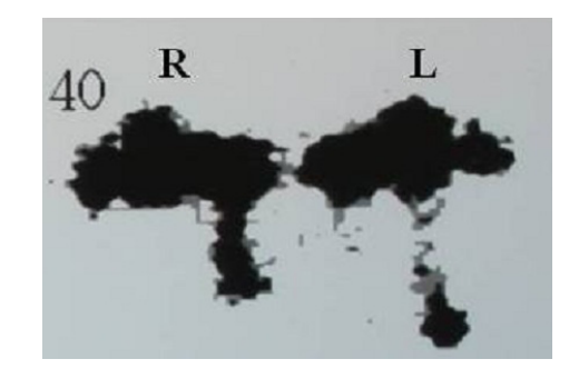
Fig 2. <sup>99m</sup>Tc tracer material in the lacrimal sac and nasolacrimal duct on the right side in the frame 40 (8 minutes and 56 seconds) indicating obstruction of nasolacrimal duct. However, the tracer material is seen draining into the nose on the left side indicating patency of nasolacrimal duct.

The images of obstruction of NLD on one side and patency of NLD on the other side are shown in Figure 2.