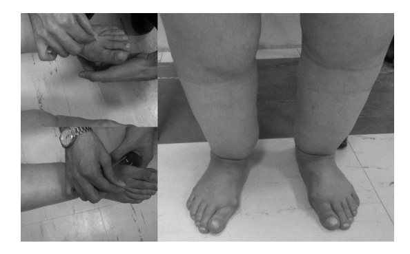
Fig 1. Picture of the lower limbs of the patients (right side). The left side shows bilateral negative Stemmer's sign.

Two equally divided doses (0.5 mCi) of <sup>99m</sup>Tc-Phytate were injected in a sub-cutaneous fashion between the first and second interdigital web spaces of both feet. post-injection, One hour whole body lymphoscintigraphy imaging of the patient was done with a dual head gamma camera (ECAM-Siemens) equipped with a low energy high resolution collimators and Tc-99m photopeak and 12 cm/min speed. The scan showed high activity in the liver and spleen, asymmetrical activity of the injection sites (considerably higher on the left side), and no inguinal nodes on the right side (Figure 2).