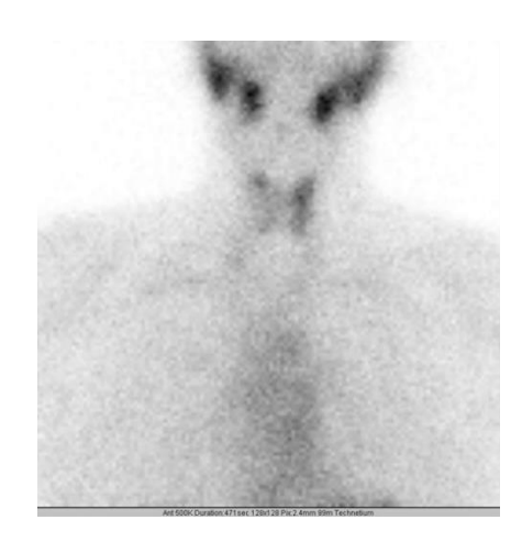
Fig 1. Thyroid scintigraphy of the patient.

128*128. (25 seconds per frame). Similar to the planar images, parathyroid mass showed no evidence of tracer activity in SPECT images (Figure 3).