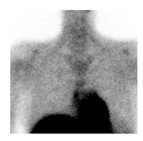
Fig 2. Tc-99m MIBI planar scintigraphy of the patient.