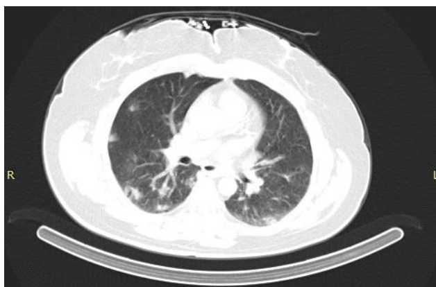
Fig 1. CT images in lung window showed multifocal, bilateral and peripheral ground glass opacities in lungs.

MPI was interpreted as relatively good coronary flow with no appreciable stress induced ischemia. There was no wall motion or wall thickening abnormality. Left ventricular ejection fraction (LVEF) derived from MPI was within normal range. SPECT-CT scan images revealed multifocal, bilateral and peripheral ground-glass opacities in lungs with subtle background uptake of Tl-201 (Figures 1 and 2).