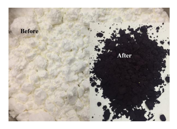
Fig 3. The starch powder before and after the stable iodine (I-127) trapping.

Fume hood was used for this study because Iodine has a volatilization nature. The first part demonstrates that the elemental Iodine trapped permanently by starch powder as showed by the deep blue color in Figure 3. This process will guarantee that the evaporated Iodine will not escape from the collected starch matrix. The starch has affinity of trapping Iodine permanently, while the sugar as an example do not have this property. The sugar was selected for comparison as it was available option and easy to show.