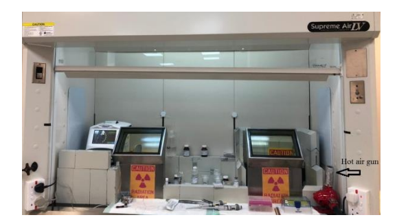
Fig 1. The experimental setup inside fume hood.

changes. Figure 2 shows the stable Iodine I-127 and the violate Iodine fumes after heating.