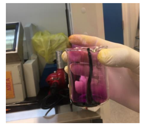
Fig 2. The stable Iodine (above) and the violate Iodine fumes after heating (below).