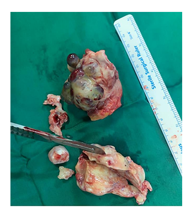
Fig 2. Two tumoral lesions were excised from the left atrium. The histopathology was compatible with osteosarcoma. Also, there was evidence of focal invasion to the myocardial fibers. The cytology of the pericardial fluid was negative for malignancy.

Tumor location, its degree of obstruction and invasion, as well as the presence of intra-cardiac clot, are responsible for the clinical presentation of cardiac tumors [1, 3, 11]. Dyspnea is the most presentation among these patients, which is secondary to the obstruction of the mitral valve [11]. Our patient primarily presented with chest discomfort and dyspnea after exercise.