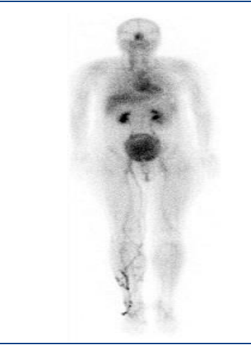
Fig 1. The 10-min delayed blood pool phase showed activity in a large round-shaped soft tissue mass with a pressure effect on the bladder in the pelvic region

While reviewing the study images, the scan revealed mild increased radiotracer uptake in both hands, elbows and shoulders, which were suggestive of joints arthritis. In whole-body blood pool and delayed planar images, a significant large round-shaped soft tissue activity with pressure effect on bladder in pelvic region was observed incidentally (Figures 1, 2 and 3).