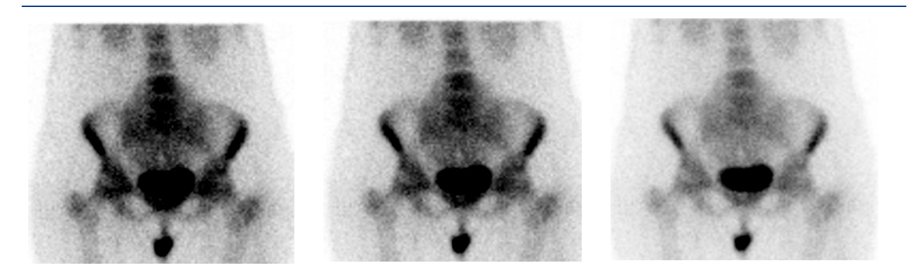
Fig 3. High-intensity anterior spot views of the pelvis show, huge round shape uptake above the bladder compatible with blood pool images and sonography findings. It is easily distinguishable from bladder uptake