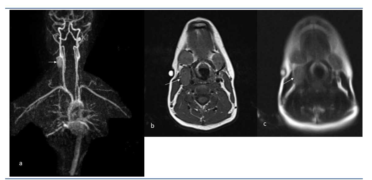
Fig 1. a. Neck MRA, 1.5 tesla magnet with FI3D technique, TWIST sequence shows there is a mass just below the common carotid bifurcation with arterial blush. b and c axial T1 & T2 TSE images reveal isosignal with small internal foci of signal void (pepper view of feeding vessels within the mass) and mildly hypersignal mass, respectively

carotid body tumor. MRI with intravenous contrast was planned and reported an isosignal 22×18 mm mass at the region of right carotid sheath with concomitant compression of the mass on the right internal jugular vein and right common carotid artery (figure 1-2). Arterial blush with lyre sign was also noticed as shown in figure 1. The diagnosis of a carotid body tumor was made upon the MRI findings and clinical presentation. Regarding the impression and low TIRADS score of the thyroid nodules, no fine needle aspiration (FNA) was carried out and the patient underwent surgery. Intraoperatively the mass approved more rigid lobuated than a carotid body tumor. The initial pathology report revealed 4 conglomerated lymph nodes one of them harboring metastatic papillary thyroid carcinoma. Three weeks later, total thyroidectomy with lateral and central lymph node dissection was carried out, in which, pathology depicted multifocal infiltrative microcarcinoma (2 nodules measuring 5mm & 7mm), with no extrathyroidal extension (ETE) and lymphovascular invasion (LVI) in background of adenomatoid thyroid tissue as well as 1 of 17 lymph nodes positive for metastasis. Hence, the patient was then referred to nuclear medicine department for radio-iodine therapy and further treatment planning (Figure 3).