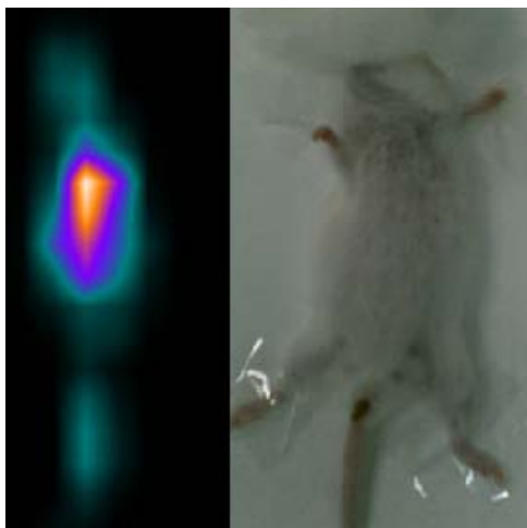
Figure 4. The planar image of a 12-week fibrosarcoma-induced mouse, one hour post i.v. injection of ^{61}\text{Cu} -ATSM (1.8 MBq).