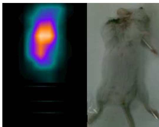
Figure 3. The planar image of hypoxic fibrosarcoma tumor in mouse one hour post i.v. injection of ^{61}\text{Cu} -ATSM (1.8 MBq).

In fibrosarcoma-bearing mouse model, with larger hypoxic tumors, the radiotracer was administered and interestingly the tumor uptake was excessively high. The only significant accumulating tissue was shown to be tumor tissue in the imaging fields. These observations were confirmed by sacrificing the animal and counting the tumor mass and the rest of carcass. The tumor:whole body count ratio was excessively high ( >40 ) (Figure 3).