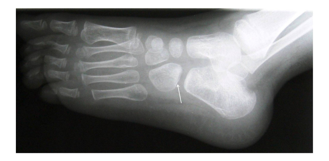
Figure 2. Plain radiography of the right foot which shows a band of sclerosis in the proximal aspect of the right cuboid bone (arrow). This is due to healing phase of the cuboid toddler's fracture.

CT scan and MRI can also show the cuboid fracture even at early stages; however in limping child the physician should be alert about possible small foot bones fractures and make sure to request appropriate MRI or CT projections. In our case the true location of the patient's symptoms was overlooked and even radiography was not performed.