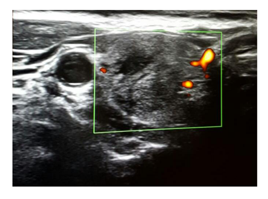
Fig 2. Current thyroid ultrasound of the patient concordant with previous US, showing two separate nodules in the upper pole of the right thyroid lobe, one of them is hypoechoic with 12x8 mm in size and the other one is isoechoic 19x16 mm in size.

Two years later the patient was again referred for thyroid scintigraphy to our department with the same symptoms. Her complaints continued time to time through this period but she claimed that they were decreased considerably. Other than using the proposed antithyroid drug treatment our patient ate 5-6 springs of Anethum graveolens 3 times per day during her complaints. Her laboratory results were as follows, TSH 0.07 μIU/ml, sT3 3.75 pg/ml and sT4 0.86, Anti-TPO: 1.2 IU/mL, Anti-TG-AB<0.9 and according to the results, she still had subclinical hyperthyroidism. Present thyroid US showed two nodules at the upper pole of the right lobe, one of them was hypoechoic 12×8 mm and the other one was isoechoic 19×16 mm (Figure 2).