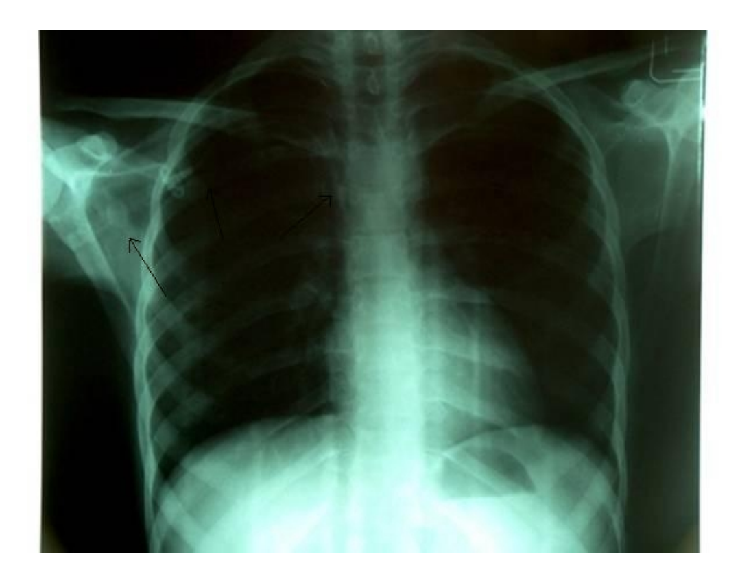
Fig 2. A posterior chest radiograph was obtained and showed a percutanous central venous line placed in the right brachiocephalic vein and superior vena cava, corresponding to the zones of abnormal radiotracer activity in the right infraclavicular and parasternal areas of whole body bone scan. Abnormal scan findings were interpreted then as radiotracer adhesion to the catheter walls.