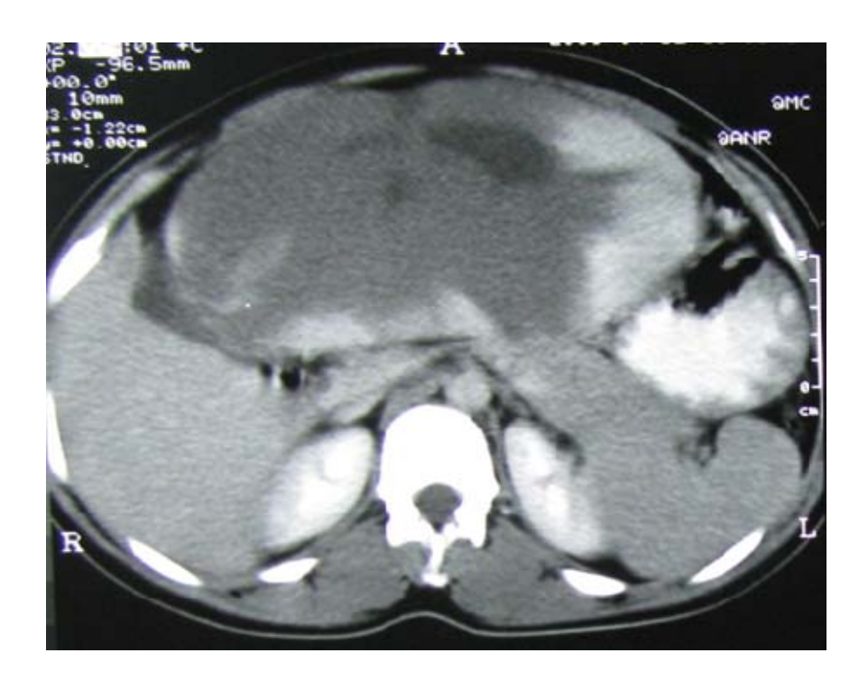
Figure 1. Large hepatic mass in the transverse images of abdominal CT-scan. Note photopenic areas inside the lesion possibly related to scarring.

Abdominal CT-scan images revealed a large hypo dense mass sized 19*15*11cm in the left liver lobe, extending to the right and lower abdominal regions (Figure 1).