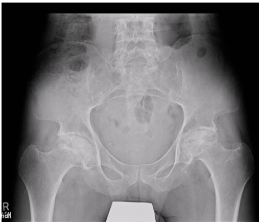
Fig 1. Pelvic X-ray AP view showing deformity with subchondral sclerosis involving both femoral heads with narrowing of joint spaces. Flattening of left femoral head is also appreciable.

A 46 years old Afghan male presented with 1 year history of pain and restricted movements over both hips and both shoulders. He was non-diabetic, normotensive with a longstanding history of alcoholism (about 5-6 years with an average intake of 300-400 ml/3-5 days/week). He had no history of oral or intravenous steroid intake. His haematological and basic biochemical investigations were unremarkable. His serum vitamin B12 and folic acid levels were also within desired limits. His pelvic X-ray revealed subchondral sclerosis with areas of lucencies in both femoral heads with mild flattening of left femoral head as well, suggestive of avascular necroses (Figure 1).