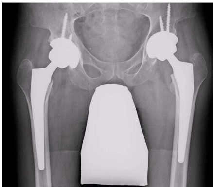
Fig 4. Pelvic X-ray AP view showing bilateral total hip replacement with shielding of genitalia.

Steroid is the primary cause in 91% [6] and 5.3% of alcoholics were found to have avascular osteonecrosis and out of these only 6.1% alcoholics had multifocal avascular osteonecrosis [7]. Pathogenesis of osteonecrosis is not clearly understood. However, strong evidence is in support of increased adipogenesis as a major underlying mechanism which causes venous sinusoidal compression leading to venous congestion, intraosseous hypertension, impaired arterial inflow,